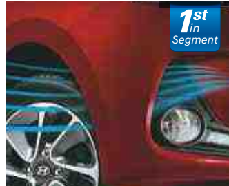
Front Air Curtains