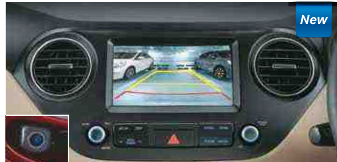
Rear Parking Assist System (with display on 7.0 Audio Screen)