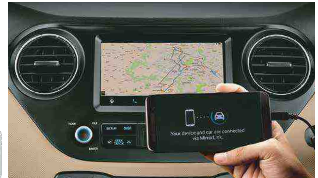
Mirror Link | Smart Phone Navigation