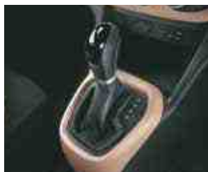
4-speed Automatic Transmission