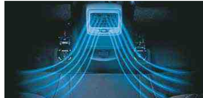
Rear AC Vent & Accessory Socket