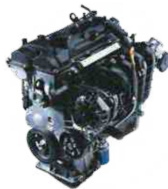
1.2L Kappa Dual VTVT Petrol Engine