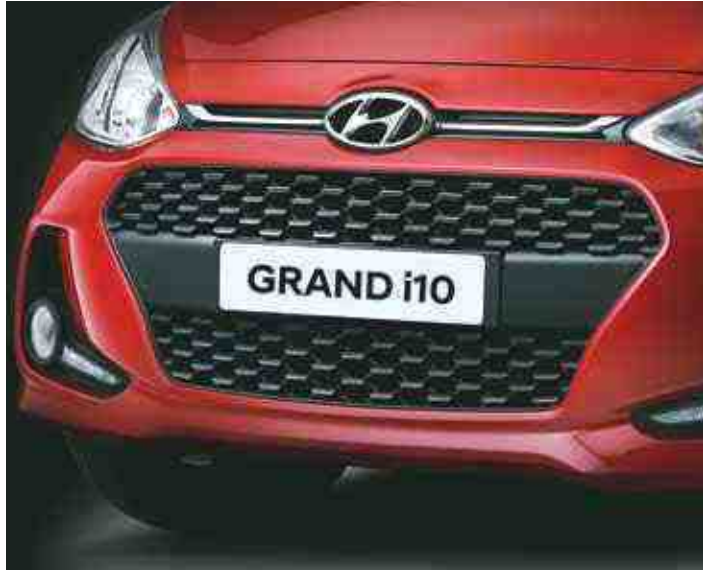
Cascade Design Grille - Bold New Design Identity