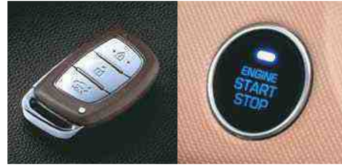
Smart Key with Push Button Start-Stop