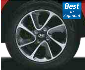
Diamond-cut Alloy Wheels