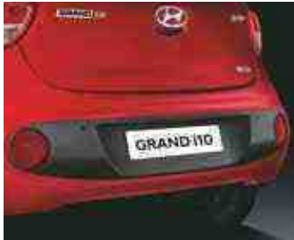
Dual Tone Rear Bumper